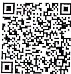
+2 / Unit 2 / Q13a Potentiometer To Find Internal Resistance Of A Cell