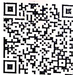
+2 / Unit 2 / Q13b Potentiometer Vs Voltmeter